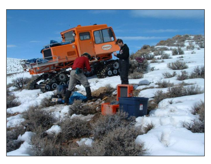
Figure 5. USGS staff installing a seismic instrument after being transported to a location near Turner Hill Station by a state Sno-Cat.

Working through incident command structure, the closed section of U.S. Hwy. 93 was reopened at 9:30 am on February 21 when the propane leak was contained and the area was declared safe for traffic. Traffic control using staff from NHP, NDOT, and local law enforcement agencies was then used to prevent access into the City of Wells. Numerous closures were established along U.S. Hwy. 93 and at the I-80/West Wells exit off-ramps to prevent direct access into the city by the public. With I-80 and U.S. Hwy. 93 open, as well as the I-80/U.S. Hwy. 93 off-ramp, all NDOT-maintained roadways were functioning normally. The remaining off-ramp closures and restrictions to the various city streets were all reopened by 10:00 am February 22.