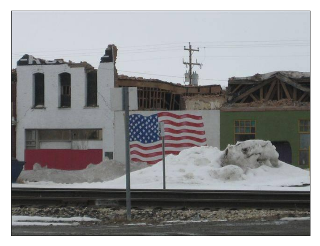
Figure 10. One of the severely damaged structures on Front Street in downtown Wells.