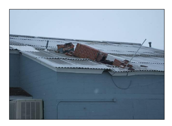
Figure 6. Failed chimney on the Wells Shop.

The equipment repair shop was found to have moderate structural damage that prevented use until after inspection and environmental testing indicated safe conditions as discussed below.