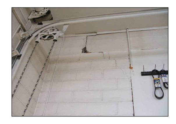
Figure 7. Cracks inside the Wells Shop.

Damage to the equipment repair shop included the following: