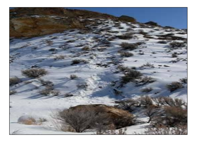
Figure 4. Large rock that became dislodged near the same area.

At 7:00 am on the day of the event, the majority of the NDOT staff began arriving at their normal duty stations throughout the district for work. By then, the district administration had a good amount of general information regarding the event and basic understanding of some of the problems and began assigning staff to address these problems. A revised set of NDOT objectives was quickly developed and put into process as follows: