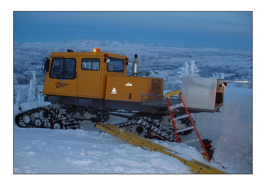
Figure 9. NDOT Sno-Cat at one of mountain-top communication sites.

Generally, the NDOT (NSRS) system operated with no major problems during the entire incident and subsequent response period. As most of the radio and microwave equipment is located at various remote mountain-top locations, it was not easily inspected. Helicopters and Sno-Cats like the one shown in figure 9 were used to gain access to various sites during the 7 days following the event as weather permitted. All communication sites were inspected for problems or damage.