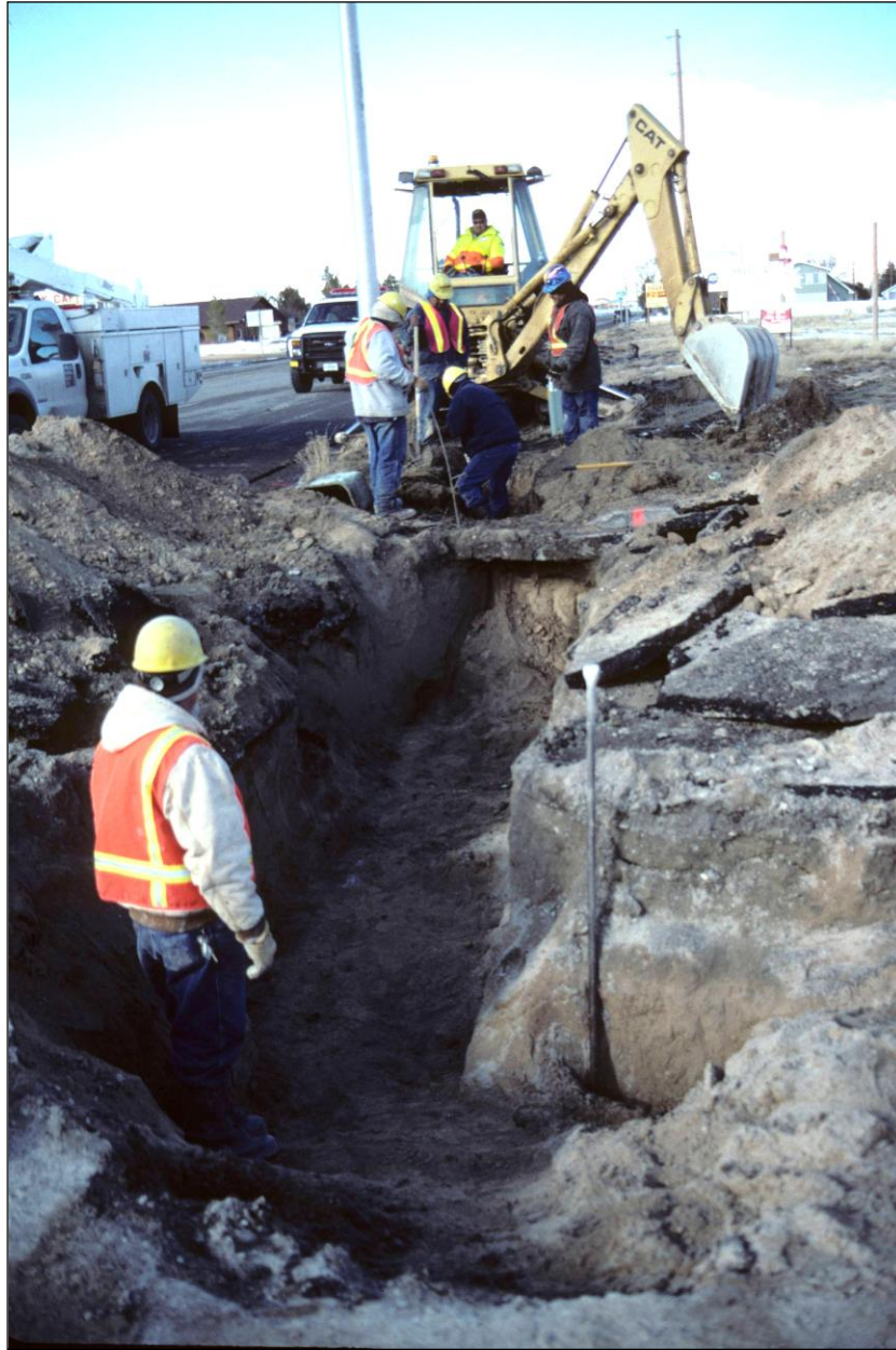
Figure 10. Digging to find a break in a water main located under a sidewalk and lamppost.

The broken water main was in the southern part of Wells, just north of the Interstate 80. It was an older line that broke once during the mainshock, and again in a major aftershock on the first day. This resulted in very visible runoff of water across the roadway. The break was isolated, the water line was turned off, and the line was fixed with the help of the maintenance people from Wendover (one of the nearest towns). After re-pressurization, the line failed again from an afternoon aftershock. This second break was more complicated, as it occurred under a sidewalk, near a lamppost (figure 10). All water-line breaks were fixed by the third day after the earthquake (figure 11).