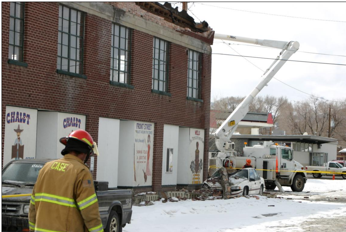
Figure 3. Wells Rural Electric Company linemen disconnecting power to a damaged building in the historical district.

There were no power line or insulator failures from the earthquake. The power had to be turned off to the damaged buildings in the historical district (figure 3), where several service lines were cut to avoid being pulled down by further building damage. There were several requests to disconnect electric power: firemen requested the power be cut to the building under construction next to the liquid propane leak, and several WREC customers asked for power to be disconnected because of damage to homes and businesses. This damage included a meter box pulling away from a home, bricks from a chimney falling on a meter box, and electrical problems at a grocery store.