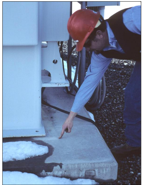
Figures 4 and 5. Above: A 51-ton 138 kV station-class transformer that shifted about 14 cm from the earthquake is shown above. Right: The transformer base is shown shifted from the mark of its prior position on the pad. The taut ground wire can be seen behind the man indicating the prior corner of the transformer. Note the anchorage hole in the base plate that was not used.

The power had to be turned off in a scheduled outage of 6 hours in order to reset the transformer. The power company did this work with its own personnel, and the crane cost $1,732 to rent. The transformer was reset, but was not anchored to prevent movement from future earthquakes.