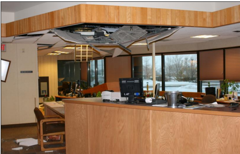
Figures 6, 7, and 8. Nonstructural damage in the Wells Rural Electric Company's front office. Top: A fallen cabinet, open drawers, and damaged ceiling can be seen and a telephone lies off the hook in the foreground. Middle and Bottom: Ceiling tile damage.