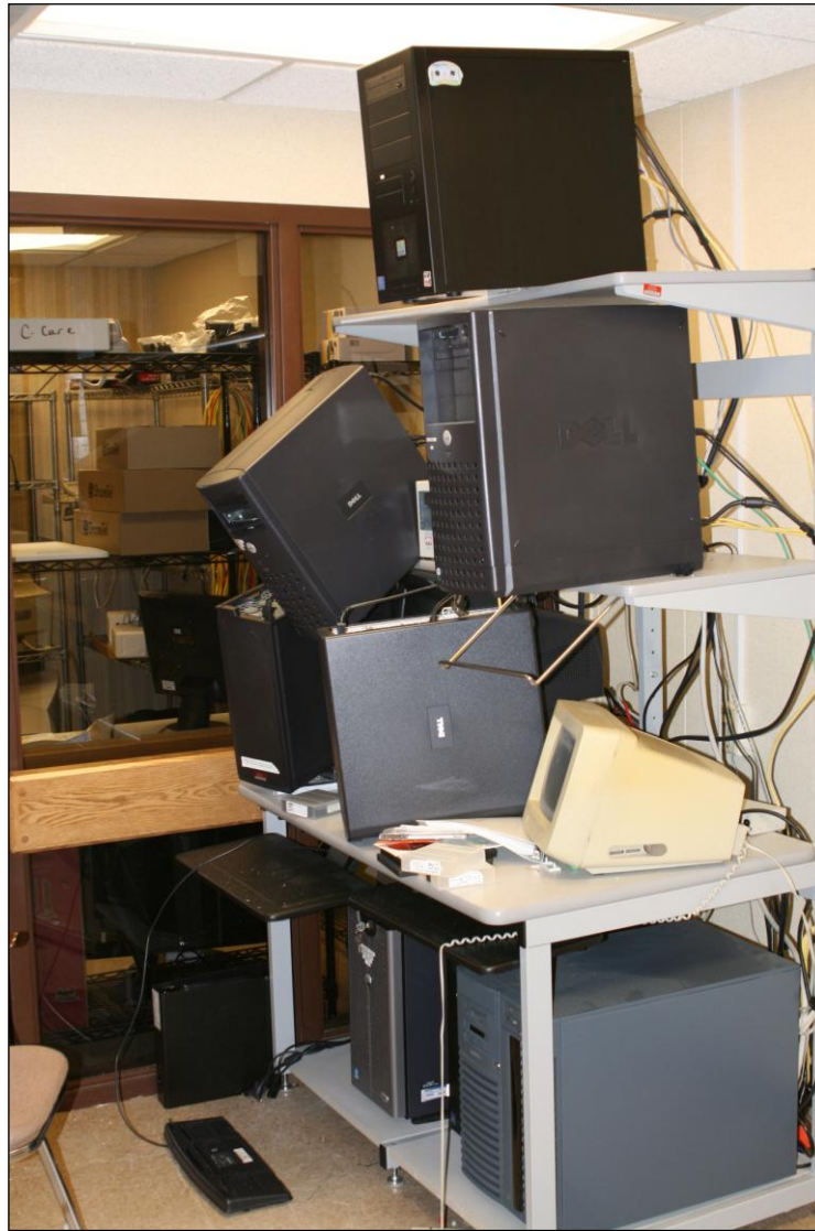
Figure 9. Remarkably resilient servers used by Wells Rural Electric. Although two servers fell onto the desk and others shifted, they remained connected and operating through the earthquake and afterwards (the fall was cushioned a little by books and papers on the table). The servers on the floor rack do not appear to have shifted at all.

WREC employees assisted in response and recovery activities when they could. One resident recalled how he had a broken chimney and was worried the broken top would fall down during an aftershock. A WREC lineman came down the street and was able to use his bucket-and-crane and safely knock down the upper part of the chimney and put a piece of plastic over the top of the broken chimney for the man. This kind of “can do” attitude is partly why the response to and recovery from the earthquake was so successful.