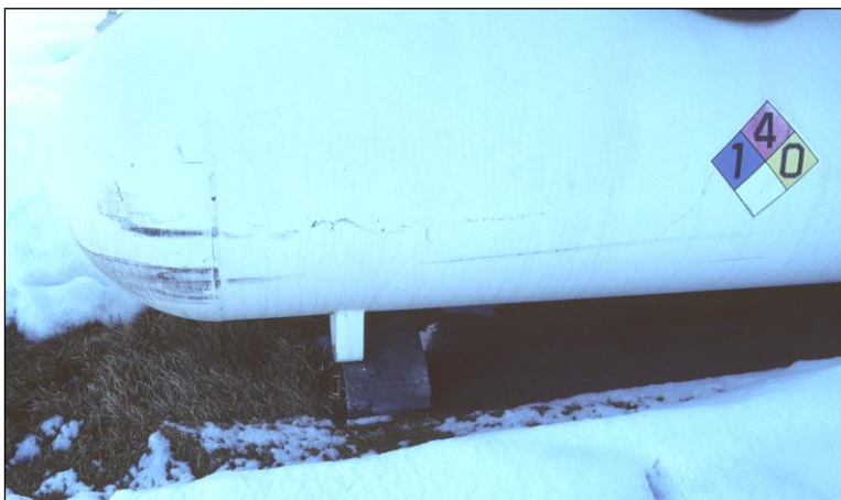
Figure 1. The tank has a flexible hose but is leaning on a rigid upright pipe feeder (left). Figure 2. Propane tank that shifted on its blocks by a few centimeters (about 1 inch) from the shaking (right).

Many water heaters and furnaces sustained some movement during the earthquake. In many instances, this movement resulted in separated venting connections. Wells Propane believes that the greatest potential danger to its customers was due to the risk of carbon monoxide poisoning from the continued use of gas appliances that required repairs to those venting systems in the hours and days after the earthquake. No water heaters failed, but a couple of them moved enough to begin to damage the minor supports they had (e.g., metal screws pulling out). Wells Propane has since begun a policy of strapping water heaters down for earthquake shaking.