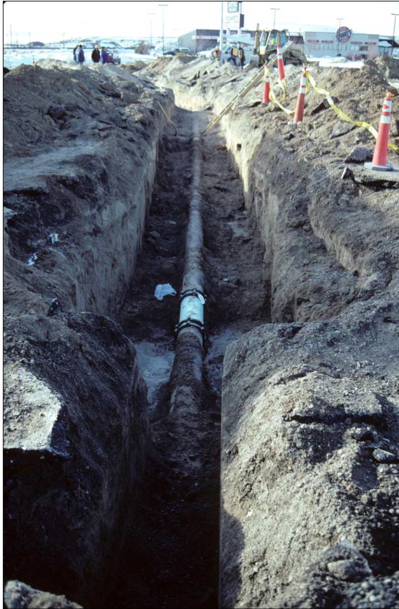
Figure 11. The area of the main water break from the mainshock. The patch in the line can be seen in the lower center.

Large water-storage tanks in and near Wells appeared to shift side-to-side as evidenced by gaps in surrounding gravel beds (figures 12 and 13). One 1,000,000-gallon-tank that was nearly full developed a small “elephant’s foot,” or bulge at the base of the tank, on one side from the earthquake. The tank did not fail or leak but vacuuming the tank for better inspection revealed cracks and broken welds on a central column inside the tank. The earthquake rocked and shifted another water tank in a similar manner, slightly damaging an electrical conduit that was connected to it.