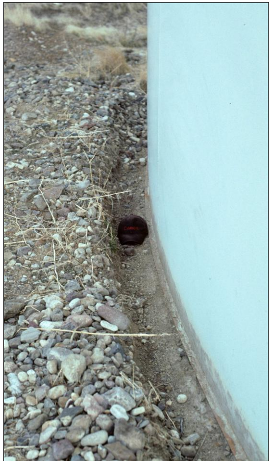
Figures 12, 13, and 14. Water tank has shifted and developed a bulge at its base (“elephant’s foot”) on one side (lower left). The shifted base is shown on the lower right with a baseball cap for scale.