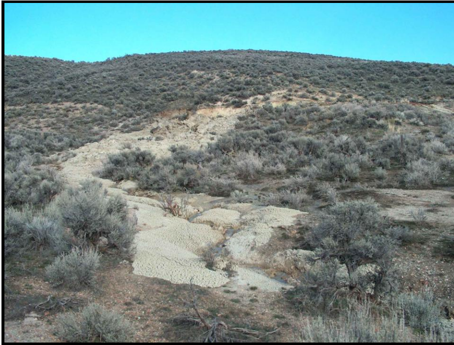
Figure 2. View looking east at the mudslide on the west side of the Snake Mountains. The scarp strikes roughly north-south for approximately 50 meters, and debris and mud extend for approximately 140 meters below the scarp. Warm springs issue from the foot of the scarp.