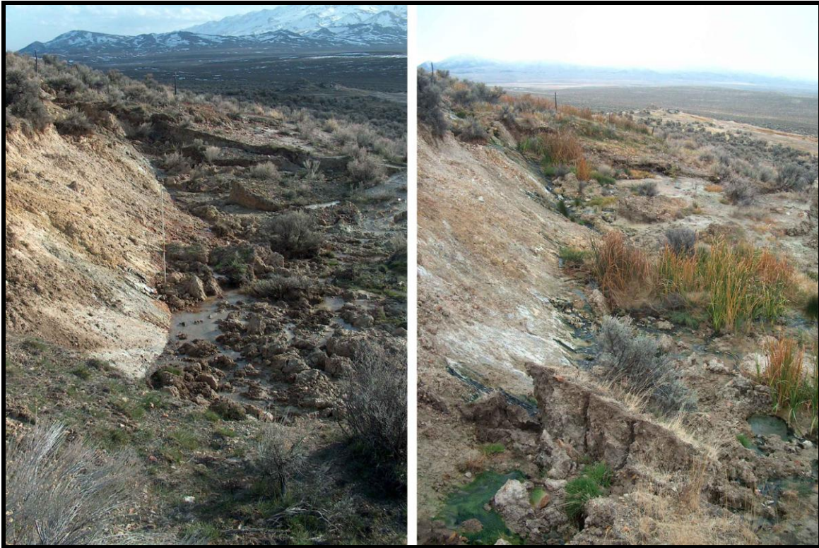
Figure 3. Views along mudslide scarp slide looking south. Left view is from March 2008, and right view is from November 2008 showing growth of cattails and algae. Scarp height is approximately 4 meters and length is approximately 50 meters. Numerous small springs and seeps issue from argillically altered rock in the scarp face and several springs percolate up through the mud at the toe of the scarp. The images show a significant change in vegetation from March to November. The lack of dead cattails and grass, and the absence of algae in the warm spring waters suggest the recent nature of the mudslide.