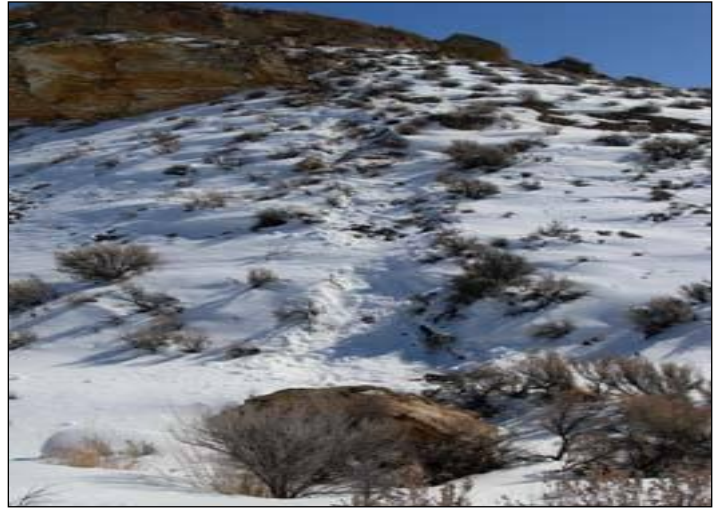
Figure 4. Large rock that became dislodged near the same area.

At 7:00 am on the day of the event, the majority of the NDOT staff began arriving at their normal duty stations throughout the district for work. By then, the district administration had a good amount of general information regarding the event and basic understanding of some of the problems and began assigning staff to address these problems. A revised set of NDOT objectives was quickly developed and put into process as follows: