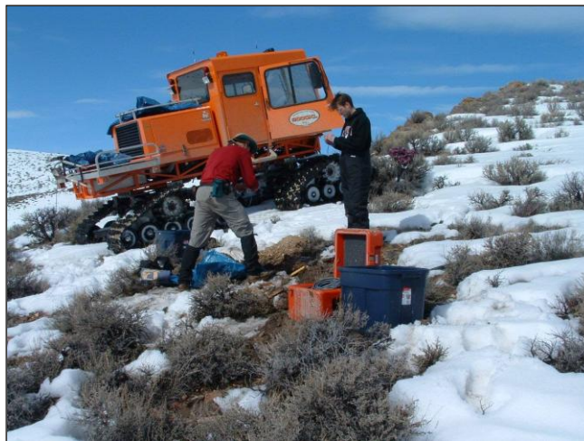
Figure 5. USGS staff installing a seismic instrument after being transported to a location near Turner Hill Station by a state Sno-Cat.

Working through incident command structure, the closed section of U.S. Hwy. 93 was reopened at 9:30 am on February 21 when the propane leak was contained and the area was declared safe for traffic. Traffic control using staff from NHP, NDOT, and local law enforcement agencies was then used to prevent access into the City of Wells. Numerous closures were established along U.S. Hwy. 93 and at the I-80/West Wells exit off-ramps to prevent direct access into the city by the public. With I-80 and U.S. Hwy. 93 open, as well as the I-80/U.S. Hwy. 93 off-ramp, all NDOT-maintained roadways were functioning normally. The remaining off-ramp closures and restrictions to the various city streets were all reopened by 10:00 am February 22.