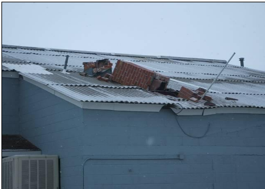
Figure 6. Failed chimney on the Wells Shop.

The equipment repair shop was found to have moderate structural damage that prevented use until after inspection and environmental testing indicated safe conditions as discussed below.