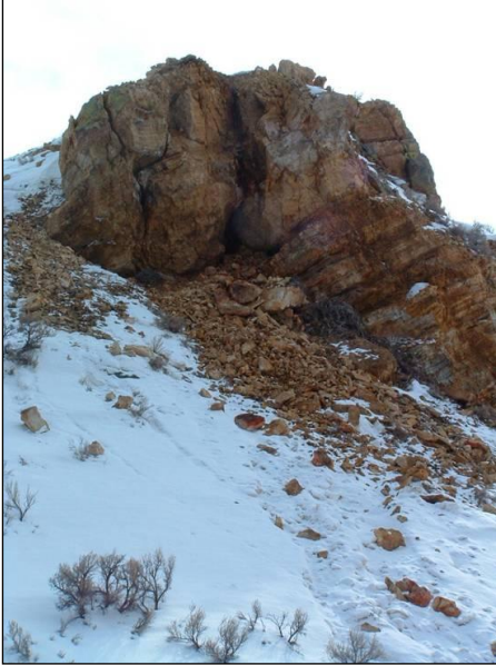
Figure 3. Rock slides near Turner Hill.