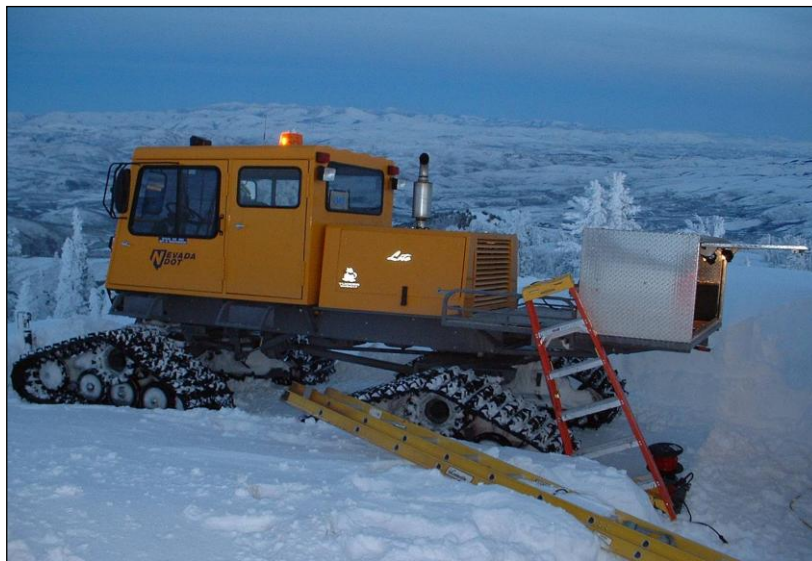
Figure 9. NDOT Sno-Cat at one of mountain-top communication sites.

Generally, the NDOT (NSRS) system operated with no major problems during the entire incident and subsequent response period. As most of the radio and microwave equipment is located at various remote mountain-top locations, it was not easily inspected. Helicopters and Sno-Cats like the one shown in figure 9 were used to gain access to various sites during the 7 days following the event as weather permitted. All communication sites were inspected for problems or damage.