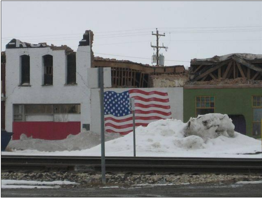
Figure 10. One of the severely damaged structures on Front Street in downtown Wells.