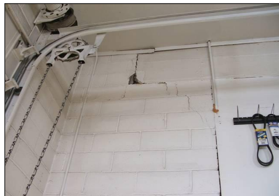
Figure 7. Cracks inside the Wells Shop.

Damage to the equipment repair shop included the following: