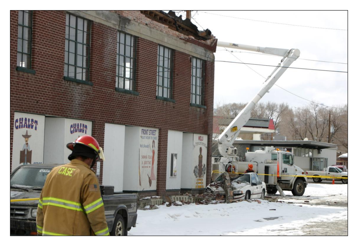
Figure 3. Wells Rural Electric Company linemen disconnecting power to a damaged building in the historical district.

There were no power line or insulator failures from the earthquake. The power had to be turned off to the damaged buildings in the historical district (figure 3), where several service lines were cut to avoid being pulled down by further building damage. There were several requests to disconnect electric power: firemen requested the power be cut to the building under construction next to the liquid propane leak, and several WREC customers asked for power to be disconnected because of damage to homes and businesses. This damage included a meter box pulling away from a home, bricks from a chimney falling on a meter box, and electrical problems at a grocery store.