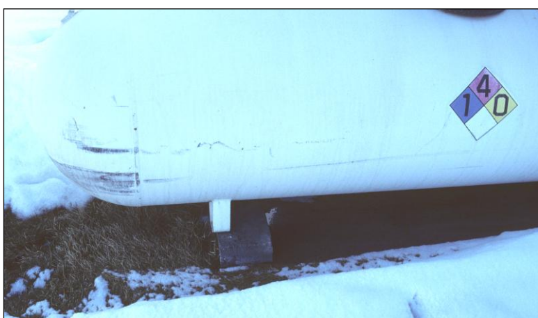
Figure 1. The tank has a flexible hose but is leaning on a rigid upright pipe feeder (left). Figure 2 . Propane tank that shifted on its blocks by a few centimeters (about 1 inch) from the shaking (right).

Many water heaters and furnaces sustained some movement during the earthquake. In many instances, this movement resulted in separated venting connections. Wells Propane believes that the greatest potential danger to its customers was due to the risk of carbon monoxide poisoning from the continued use of gas appliances that required repairs to those venting systems in the hours and days after the earthquake. No water heaters failed, but a couple of them moved enough to begin to damage the minor supports they had (e.g., metal screws pulling out). Wells Propane has since begun a policy of strapping water heaters down for earthquake shaking.