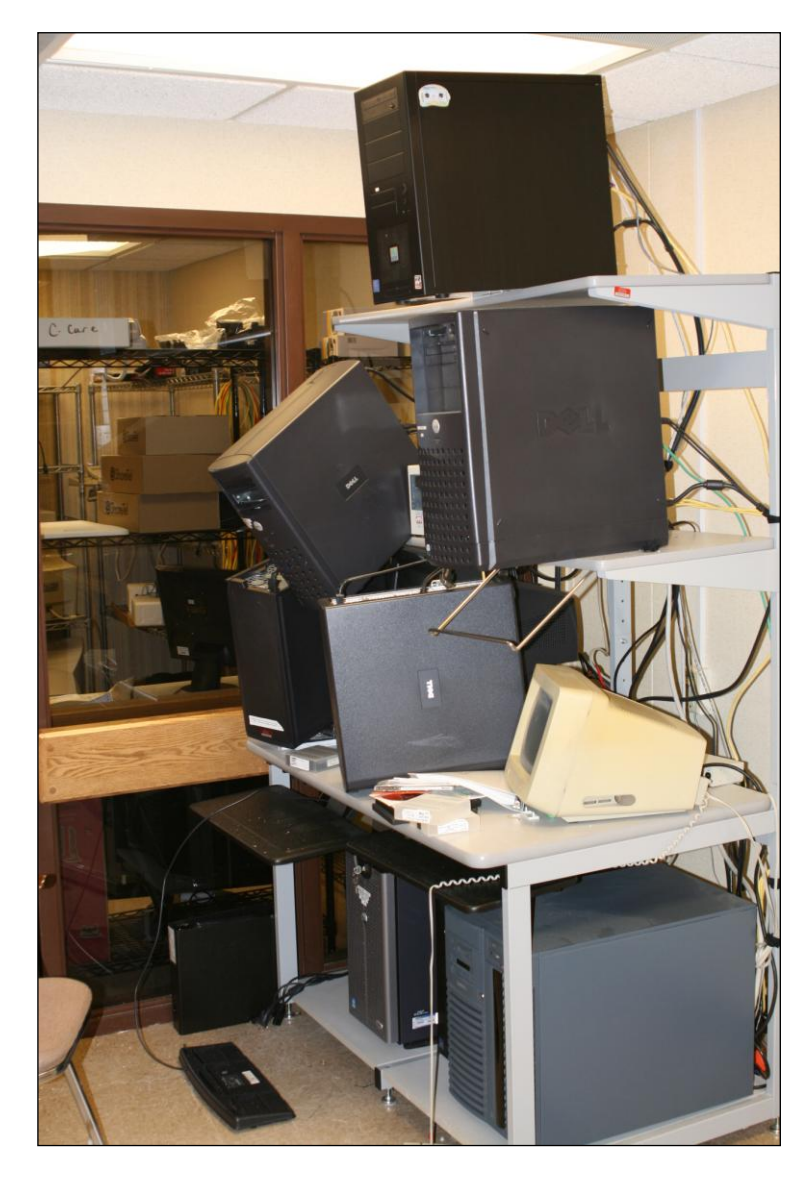
Figure 9. Remarkably resilient servers used by Wells Rural Electric. Although two servers fell onto the desk and others shifted, they remained connected and operating through the earthquake and afterwards (the fall was cushioned a little by books and papers on the table). The servers on the floor rack do not appear to have shifted at all.

WREC employees assisted in response and recovery activities when they could. One resident recalled how he had a broken chimney and was worried the broken top would fall down during an aftershock. A WREC lineman came down the street and was able to use his bucket-and-crane and safely knock down the upper part of the chimney and put a piece of plastic over the top of the broken chimney for the man. This kind of "can do" attitude is partly why the response to and recovery from the earthquake was so successful.