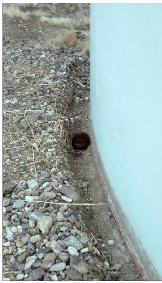
Figures 12, 13, and 14. Water tank has shifted and developed a bulge at its base ("elephant's foot") on one side (lower left). The shifted base is shown on the lower right with a baseball cap for scale.