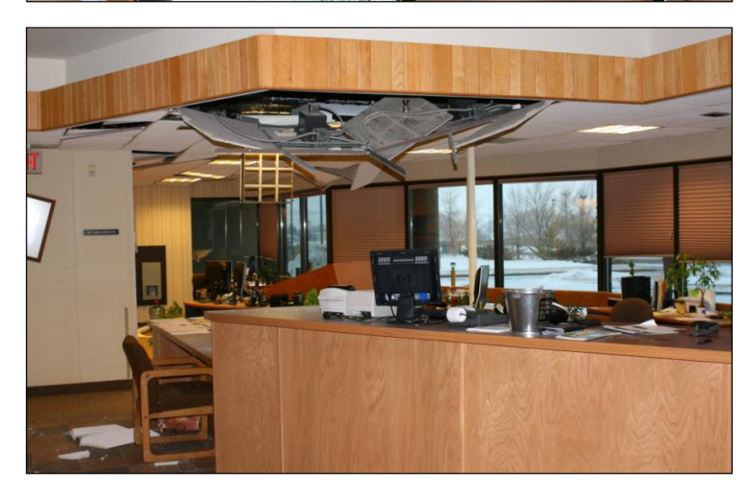
Figures 6, 7, and 8. Nonstructural damage in the Wells Rural Electric Company's front office. Top: A fallen cabinet, open drawers, and damaged ceiling can be seen and a telephone lies off the hook in the foreground. Middle and Bottom: Ceiling tile damage.