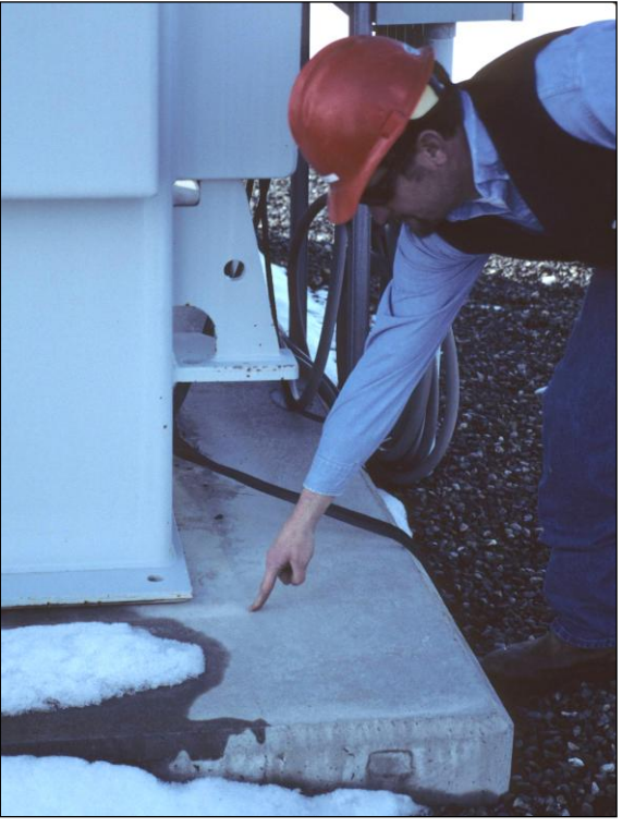
Figures 4 and 5. Above: A 51-ton 138 kV station-class transformer that shifted about 14 cm from the earthquake is shown above. Right: The transformer base is shown shifted from the mark of its prior position on the pad. The taut ground wire can be seen behind the man indicating the prior corner of the transformer. Note the anchorage hole in the base plate that was not used.

The power had to be turned off in a scheduled outage of 6 hours in order to reset the transformer. The power company did this work with its own personnel, and the crane cost $1,732 to rent. The transformer was reset, but was not anchored to prevent movement from future earthquakes.