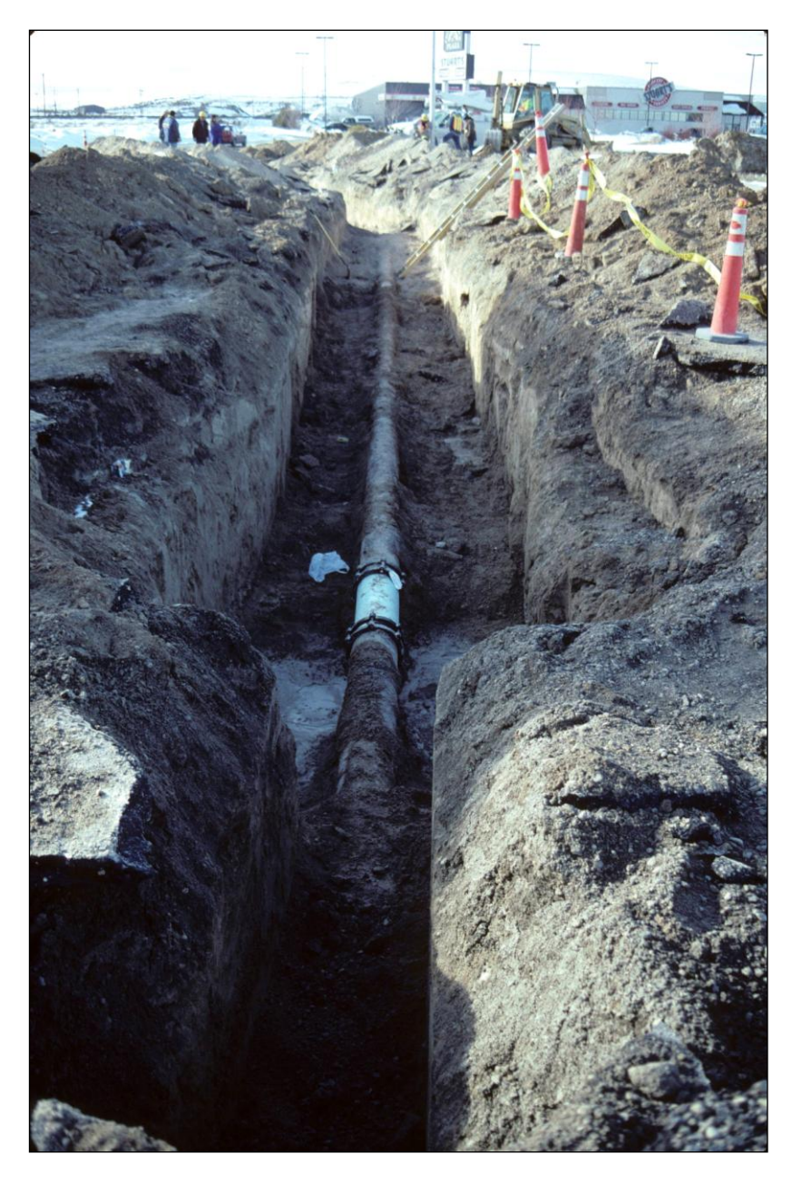
Figure 11. The area of the main water break from the mainshock. The patch in the line can be seen in the lower center.

Large water-storage tanks in and near Wells appeared to shift side-to-side as evidenced by gaps in surrounding gravel beds (figures 12 and 13). One 1,000,000-gallon-tank that was nearly full developed a small "elephant's foot," or bulge at the base of the tank, on one side from the earthquake. The tank did not fail or leak but vacuuming the tank for better inspection revealed cracks and broken welds on a central column inside the tank. The earthquake rocked and shifted another water tank in a similar manner, slightly damaging an electrical conduit that was connected to it.