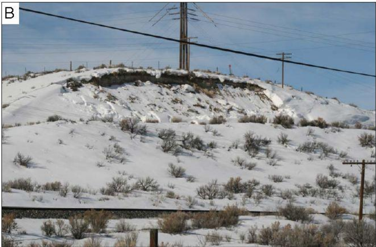
Figure 4. Snow disturbed in the Wells earthquake, showing (A) fractures, spaced about 10 to 50 cm apart, on a hillslope northeast of the epicenter; and (B) a failed deposit of wind-blown snow along a north-facing railroad cut slope southeast of the epicenter. Photographs taken February 27 (A) and 28 (B), 2008.