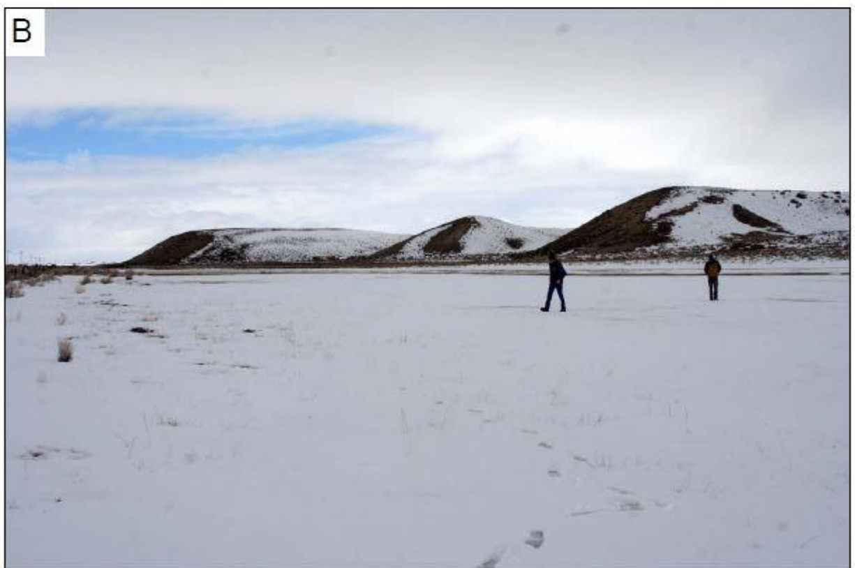
Figure 2. Investigation of (A) a water main damaged in the Wells earthquake (pipe is about 25 cm in diameter; inset shows repaired section), and (B) the partly frozen flood plain of the Humboldt River north of Wells. Neither site contained geologic evidence for strong seismic shaking; photographs taken February 22, 2008.