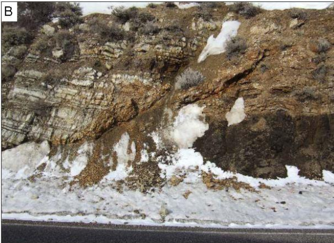
Figure 3. Rock falls related to the Wells earthquake, showing (A) dislodged boulder (approximately 2 m high and 3 m wide) north of Wells; view is to the southeast; and (B) cobbles and boulders southwest of Wells along Secret Pass road in the East Humboldt Range. Photographs taken February 23 (A) and 22 (B), 2008.