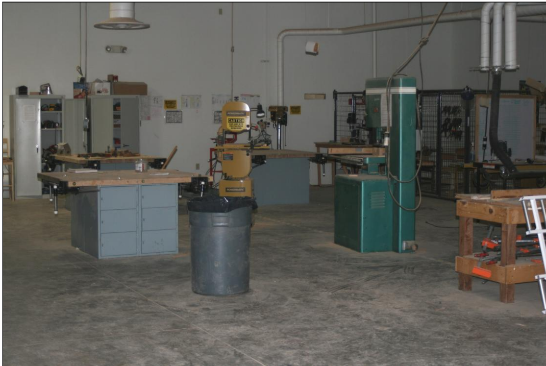
Figure 12. Southwestern part of the high school wood shop. The shop had been swept but a halo of sawdust was left around the equipment so the tracks could be measured.