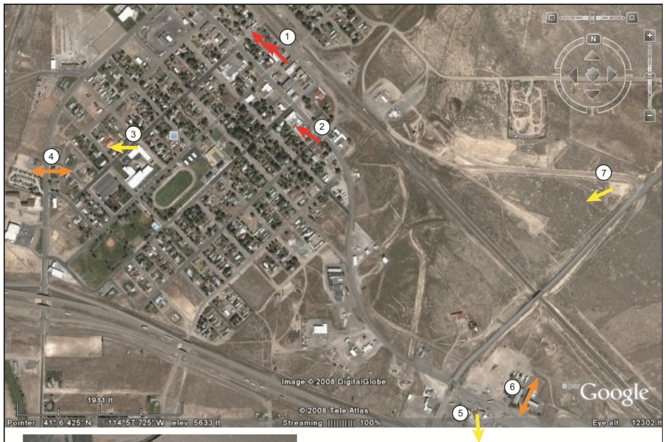
Figure 2. Locations of seven areas where objects were thrown, toppled, or slid in response to the ground motion from the 2008 Wells earthquake. This is a small subset of sites where measurements could have been made, but it serves as an example of the kinds of measurements that can be made; not all locations are on this map. Red —objects that were thrown; yellow —objects that were slid; orange double arrow—strongest shaking direction that contents were thrown. Objects are described in the listing below: