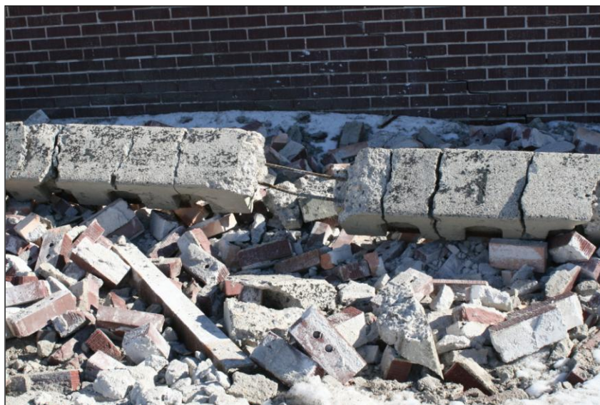
Figure 7. Section of sub-evenly spaced transverse cracks that may have been formed from the uneven impact of the bond beam on the ground; this is the same bond beam that crushed the car that is shown in figures 3, 5, and 6. Here, about midway down the block, the bond beam is close to the building. This pattern is mostly present in this area, which is the area between the two buildings; the bond beam may have fallen off at slightly different times or may have been delayed by the impact on the balcony causing a differential impact with the ground.