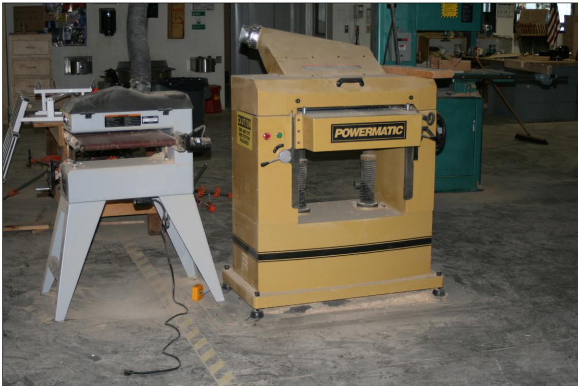
Figure 16. Massive free-standing metal press.