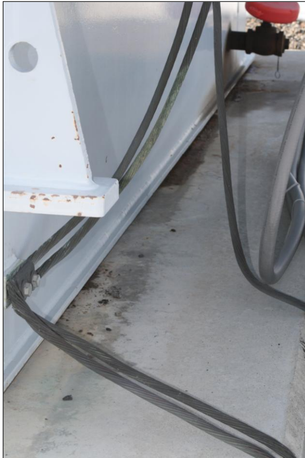
Figure 27. Northeastern side of the transformer base showing the prior mark of where it was before the earthquake.