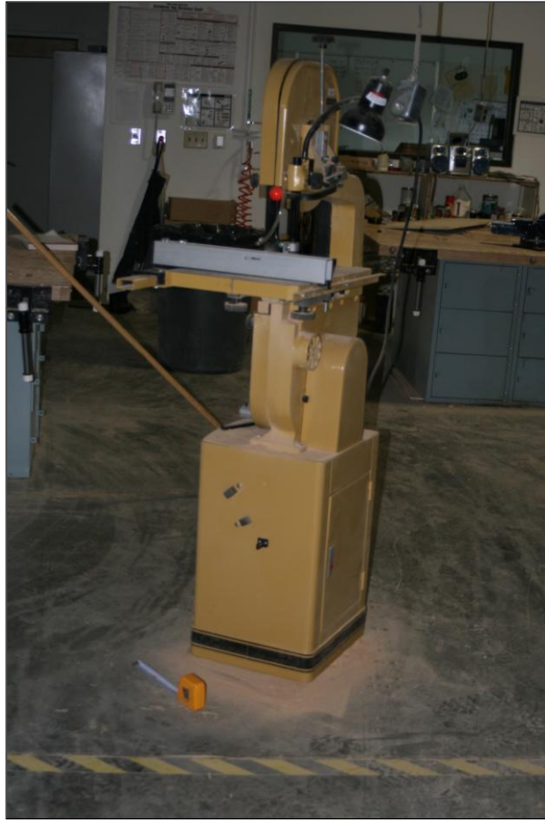
Figure 19. Band saw that walked in response to the earthquake, probably because of its vertical eccentricity and heavy base.