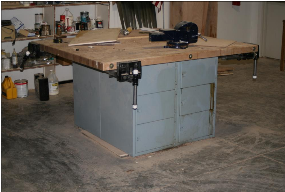
Figure 22. These table tops with a locker base were the most equidimensional objects in the shop with a relatively even distribution of mass slid the general direction of all the objects, suggesting they were the most precise measurements that could be made (had the least modulation from the object itself). There were two tables like this and both were moved uniformly 4.5 cm in a direction of 271°.