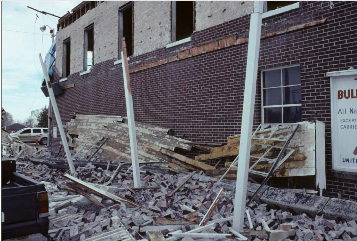
Figure 8. Northern part of the fallen crowning bond beam in front of the Bullshead Bar. The bond beam is currently about 0.5 to 1 m from the building.