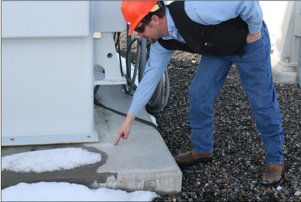
Figure 26. Wells Rural Electric worker indicates where the corner of the transformer was before the earthquake shifted it into the position now shown in the photograph. The transformer has since been reset to its original position.