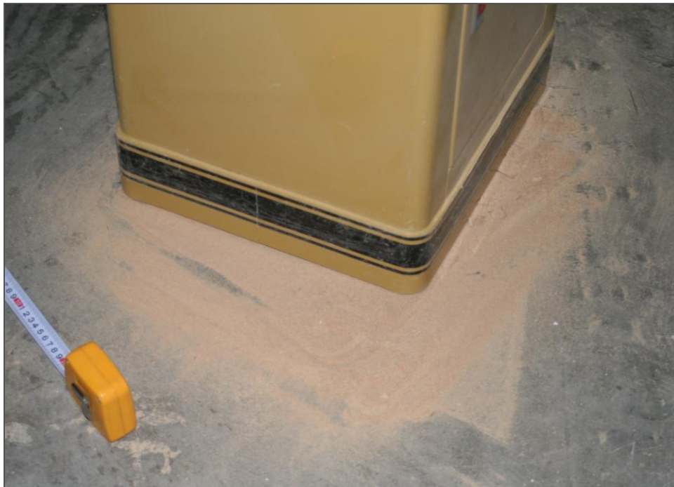
Figure 20. Rocking and twisting of bandsaw shown in figure 19. left footprints made from the sawdust within the base of the machine. The largest step is the first, then there are ghost prints indicating the saw rocked back and forth with some rotation in between steps an addition four times to get to its final position. The final position showed counterclockwise rotation of about 30° from the initial position.