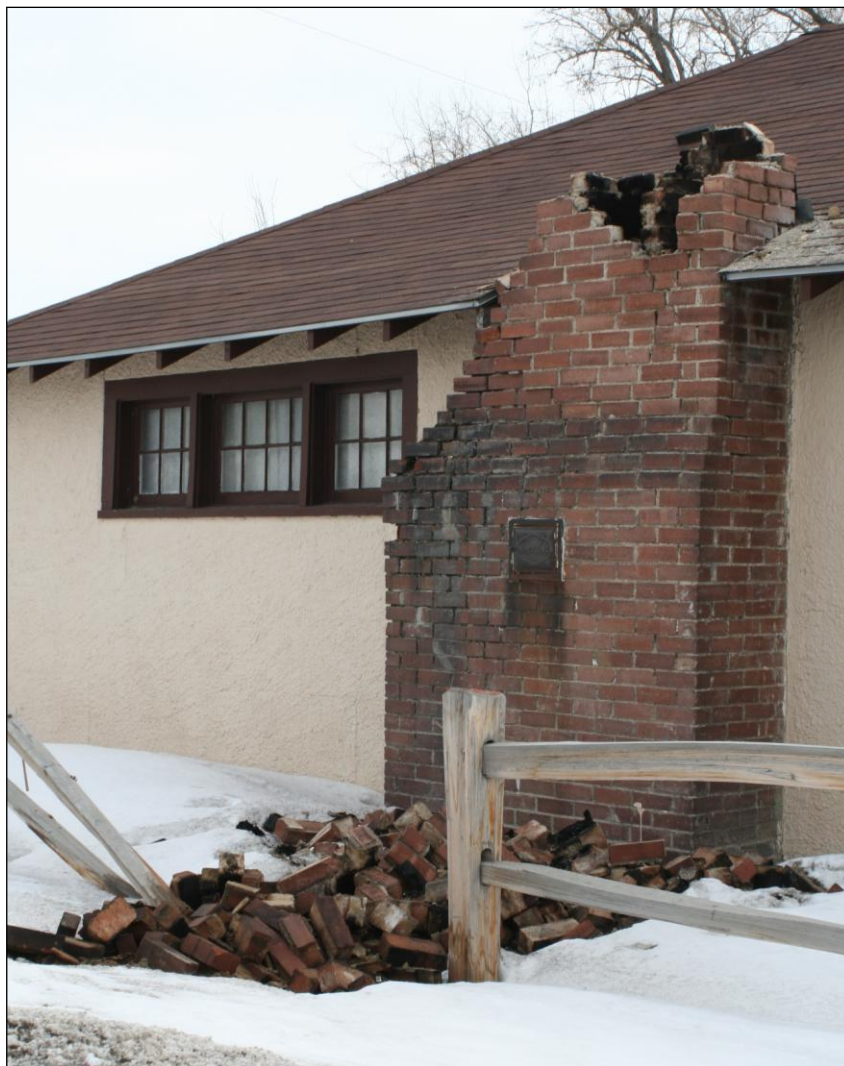
Figure 12. Chimney that was toppled and lies in a rough order with the bricks from the bottom of the chimney near its base and the bricks from near the top of the chimney near where the fence was crushed.

Although it was not always clear how things toppled or how a progressive failure versus a clean failure influenced the direction of a toppled object, this is the most common kind of measurement that could be made. Many features exist of the outside of buildings that can be observed, and contents inside buildings can also exhibit a preferential toppling direction, but this commonly has a component of the building response to it. An example is two parallel walls that things fell off of versus the other walls, where thing stayed put, which happened in many homes in the Wells downtown. What makes it a topple failure versus a free fall, is an orderly arrangement on the ground of the bricks of the chimney or wall that fell, versus a pile of bricks near the edge of the break. It certainly doesn't have to be perfectly in order, although it is remarkable how it can be, but in general the top of the object is near the outside of the debris field, and the base is close in.