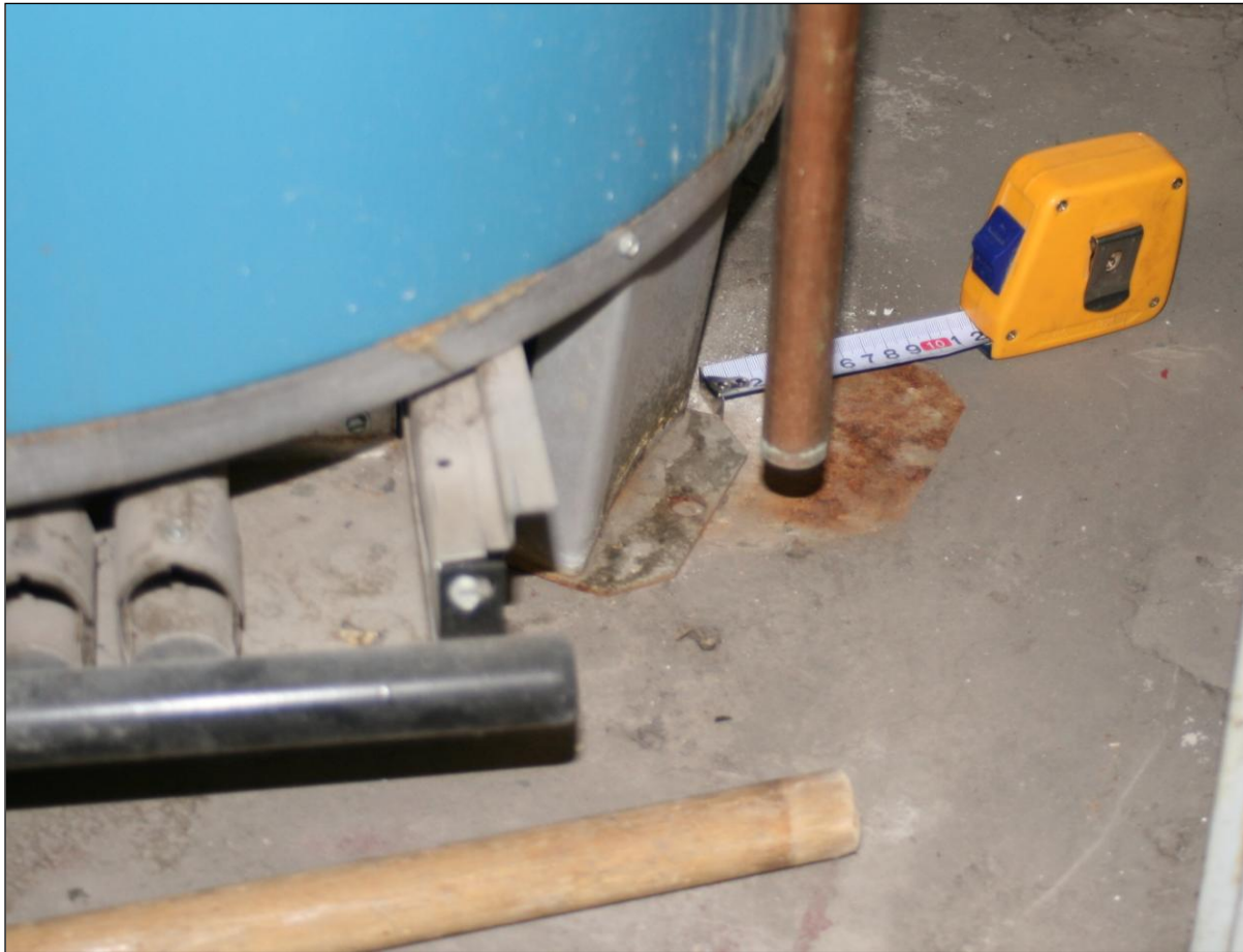
Figure 29. The foot of the water heater and the rusted footprint of its pre-earthquake location.