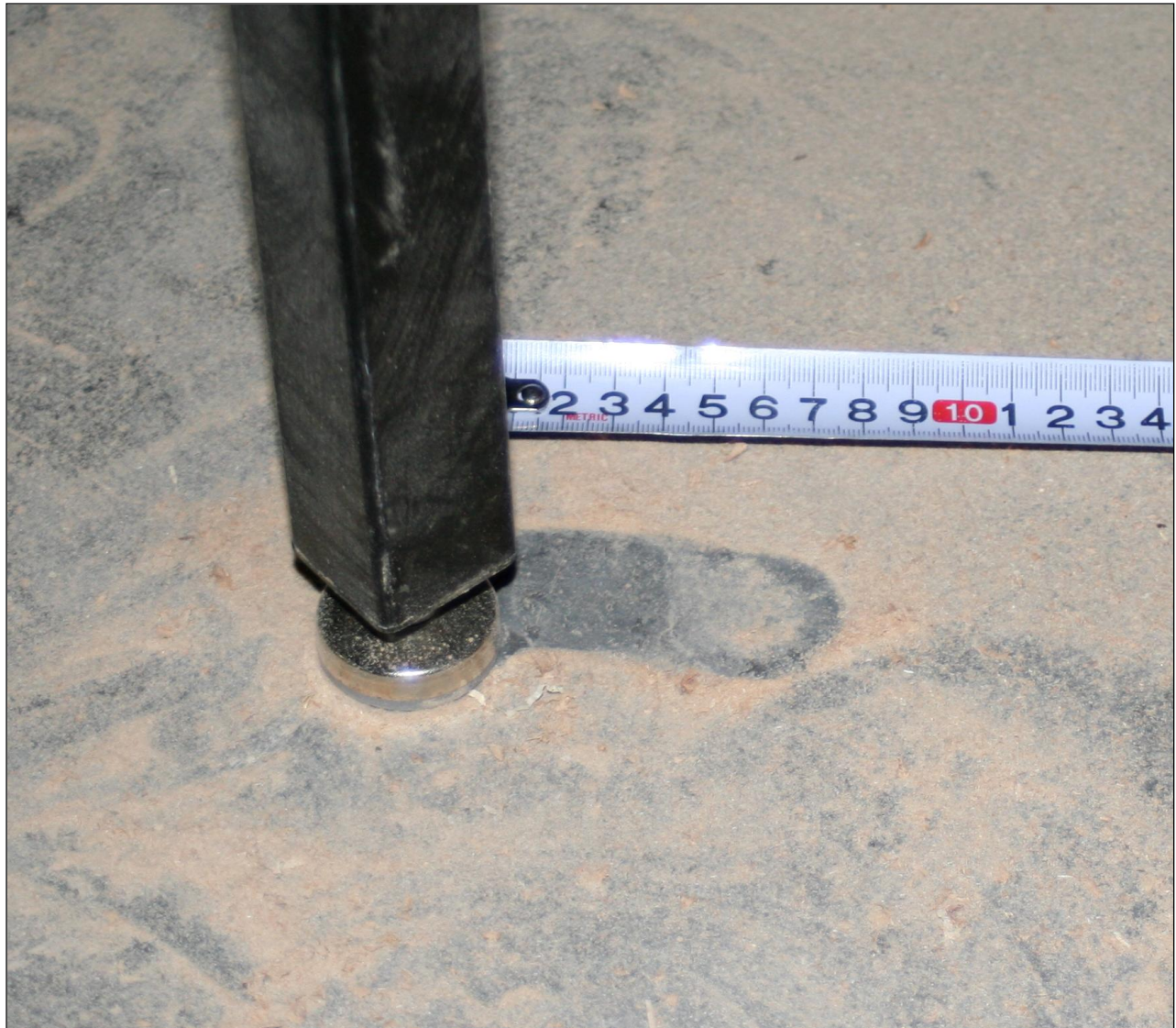
Figure 14. Jumping and sliding track of a router leg; the ruler is in the same position as in figure 13. Note the initial location of the right side of the round silver foot at approximately 8 cm on the ruler. There is a rough circle of where the contact was initially on the floor and an area of sawdust inside this circle. The left side of this circle has some dust on. This leg of the machine appears to have jumped at the start to have left this track; the jump is about the width of the foot, or about 2 cm. At 4+ cm on the ruler the area of cleared dust in the track has an abrupt, concave to the left shape indicating the foot was back in contact with the floor at that point and was sliding to the left at that point. The foot slides 3 to 4 cm to the left, and then changes direction almost 80° and slides 1.5 to 2 cm towards the lower left corner. The total offset of the main displacement to the left was about 6.5 cm in a direction of 271°. Not all the tracks from the legs of the router are the same indicating there is some modulation of these tracks from the response of the router to the shaking.