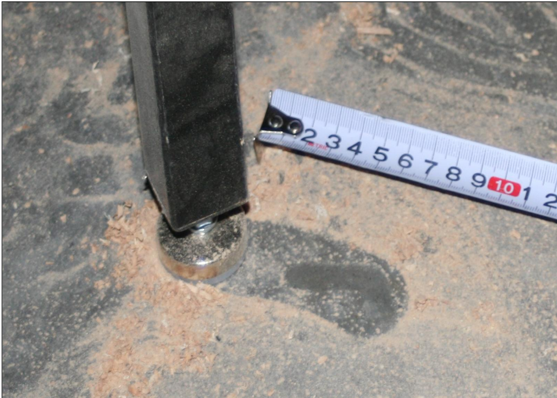
Figure 15. Router leg track from the front right leg in figure 13. This leg slid in a very gentle arc, starting in a 291^\circ direction and within \sim 1 cm changing to an approximate direction of 277^\circ . This track is about 7 cm long. The finger scrape was an observation of the roughness of the floor, which had a very smooth concrete finish.