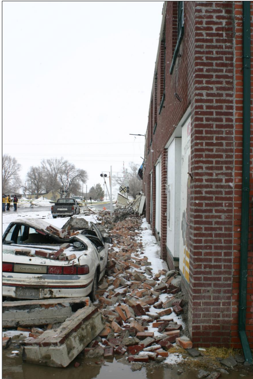
Figure 3. View to the northeast along the sidewalk along the northwestern side of the Wells Chalet (near) and the Bullshead Bar (down the block where the collapsed balcony is). The corner of the crowning concrete bond beam can be seen as can the corner of the building it was on top of. The corner is only a couple to few decimeters to the southwest of the building corner whereas the estimated horizontal distance between where the bond beam was at the two-story roof level and where it impacted the car as indicated by the divot in its roof is 1.8 m, +/- 0.5 m.