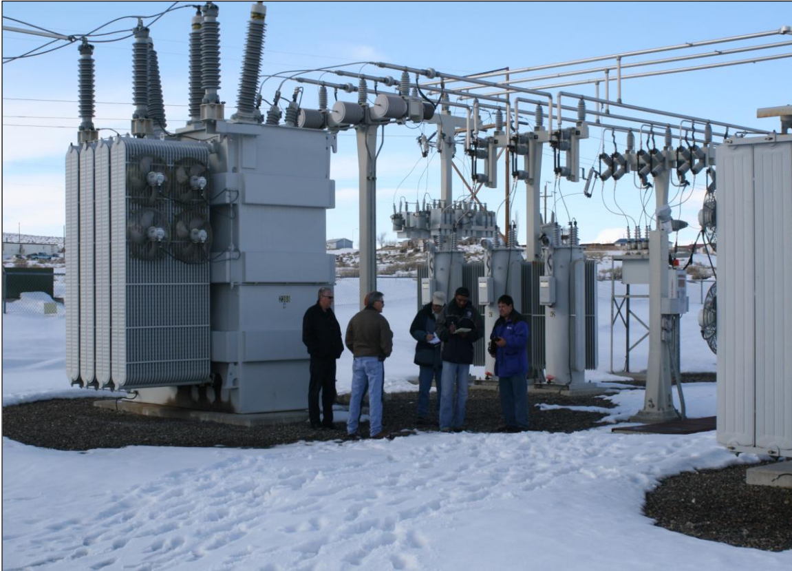
Figure 25. The transformer on the left is the one that was shifted by the earthquake ground motion.

A 92,600-pound (41,950 kg), unattached transformer sitting not far from the measured one did not appear to have moved.