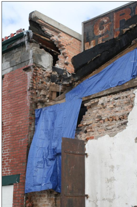
Figure 10. Large concrete beam on the southwestern side of the Wells Chalet where it has punched a hole in the southeast wall. This supports a major rocking of the Wells Chalet in a northwest-southeast direction of excitation, or ground motion.