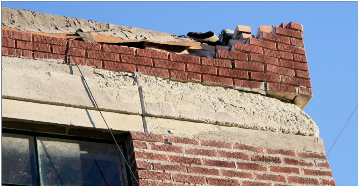
Figure 4. Remaining upper part of the southwest corner of the Wells Chalet. The crowning bond beam sat on top of at least 10 and as many as 14 courses of bricks, and fell off with at least seven or eight courses, but limited perhaps by the strength of the underlying bond beam. Note the spalled off parts of the upper part of the concrete beam; this damage may have been inflicted by the rocking back-and-forth of the upper part of this wall/parapet.