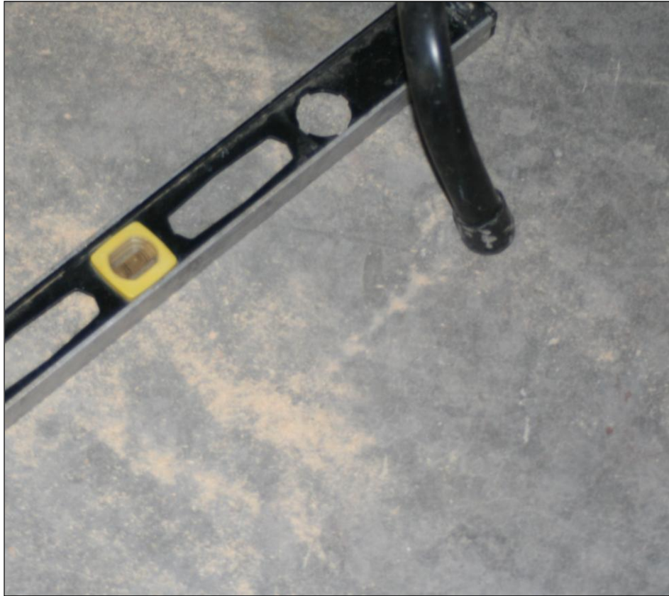
Figure 21. A relatively light radial arm saw table with four legs and rubber feet shows several (seven?) steps it made during the earthquake as it shuddered across the floor, perhaps with each oscillation of strong shaking. The tracks from the western legs were 14 and 15 cm in a direction of 261°.