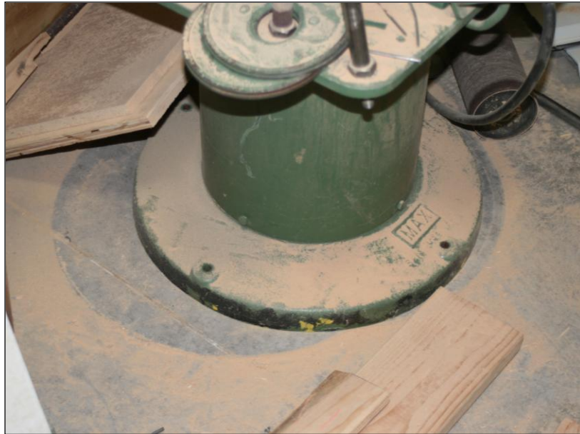
Figure 23. Wobbling pattern back-and-forth of a round metal object in the shop; the direction generally matched the other tracks but it was not measured.