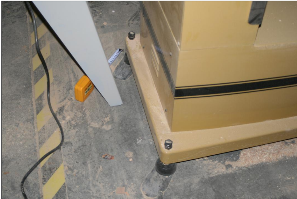
Figure 17. Tracks of the feet of the massive metal press shown in figure 16.