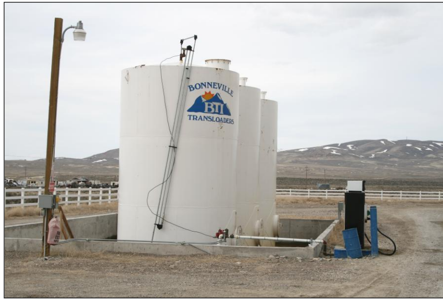
Figure 30. Fuel tanks that were shifted by the earthquake.