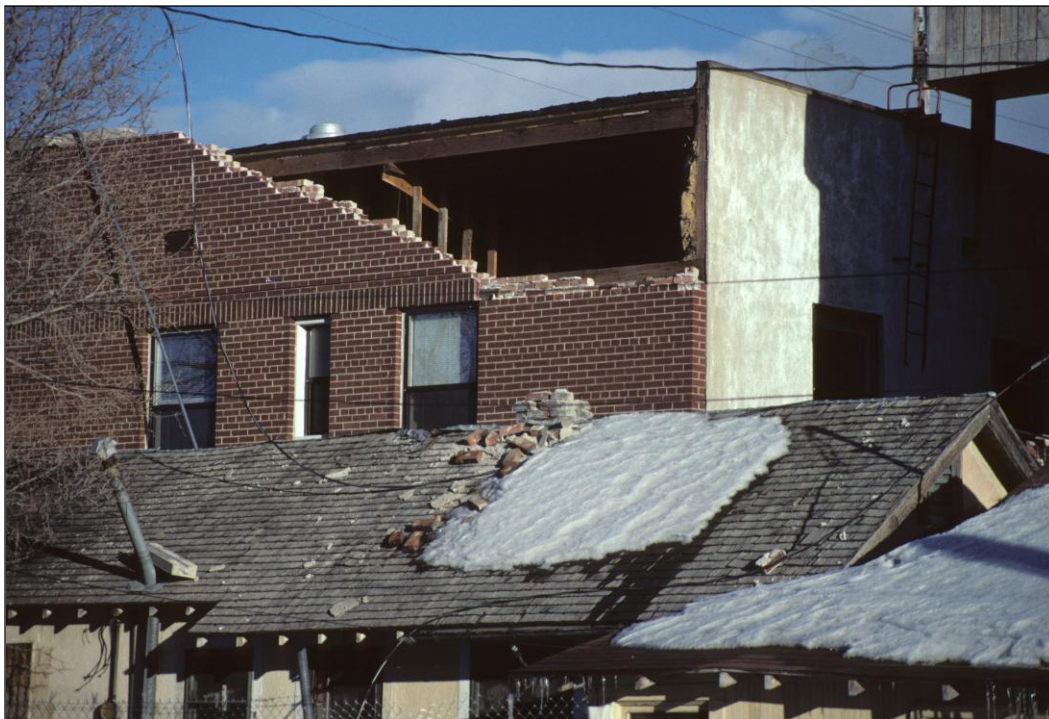
Figure 11. Northwestern side of the El Rancho Hotel and the small one-story house to the northwest of the building. A piece of the bond beam from the El Rancho can be seen caught up against the metal stove pipe that fell far enough west to clear the crest of the roof of the house and the bricks from the damaged house chimney are strewn to the northwest on the house roof, indicating strong ground motion in a northwest-southeast direction.