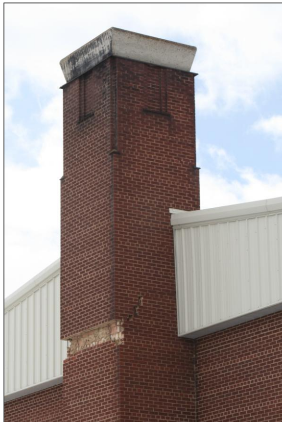
Figure 24. Large chimney on the northeastern side of the Wells High School auditorium. The top of the chimney was cocked back towards the building, as indicated by the tension cracks on the opposite side and the bricks that were thrown out of the unreinforced brick chimney. The tension cracks on the side of the chimney indicate a hinge point near the contact of the chimney and the top of the roof. The direction of ground motion indicated by the chimney is about 45^\circ of the ground movement direction indicated in the woodshop, which is immediately to the west of the chimney; this is an example of how different the direction of strongest shaking from a building and that from free-standing equipment can be.