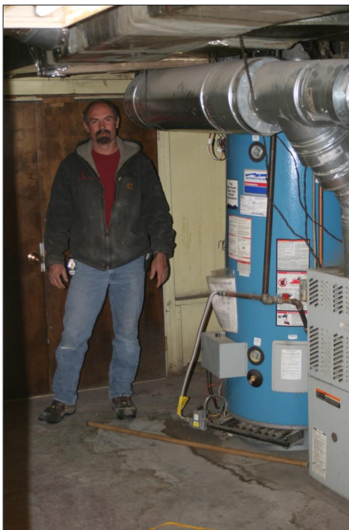
Figure 28. The blue industrial water heater that slid in the basement of the 4-Way Casino.

The other water heater moved in a similar, if not exactly the same, direction and had flexible hosing, but had been reset before I could view it.