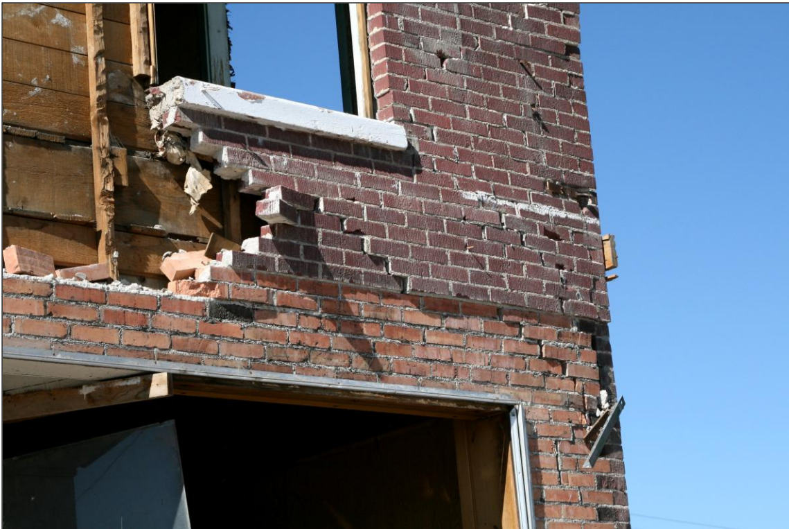
Figure 9. "X" fracture patterns in the remaining brick veneer in this northeast-facing wall of the Bullshead Bar indicates the building rocked parallel to the wall. The eastern part of the crowning bond beam on this wall fell on the roof, whereas the rest fell off the side.