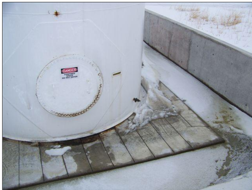
Figure 31. The fuel tank was shifted as indicated by the cast of its edge that was left in the snow. This is the farthest tank shown in figure 30.