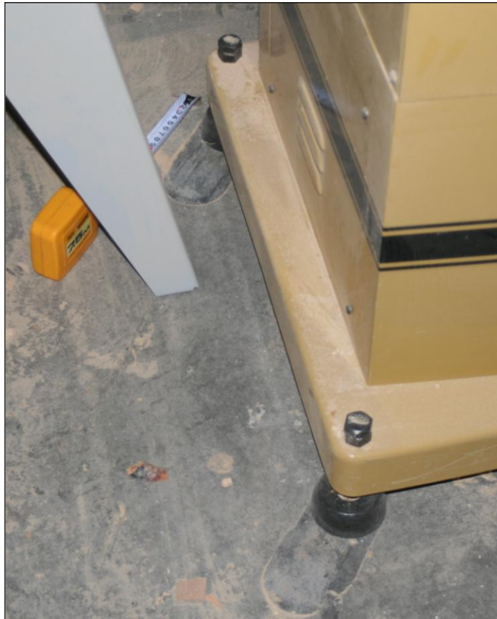
Figure 18. Fairly straight tracks in constant contact with the floor from these hard rubber feet, with possible rubber scrape marks in the upper track. These two legs slid in the same direction, 281^\circ and about the same distance, 9.5 cm.