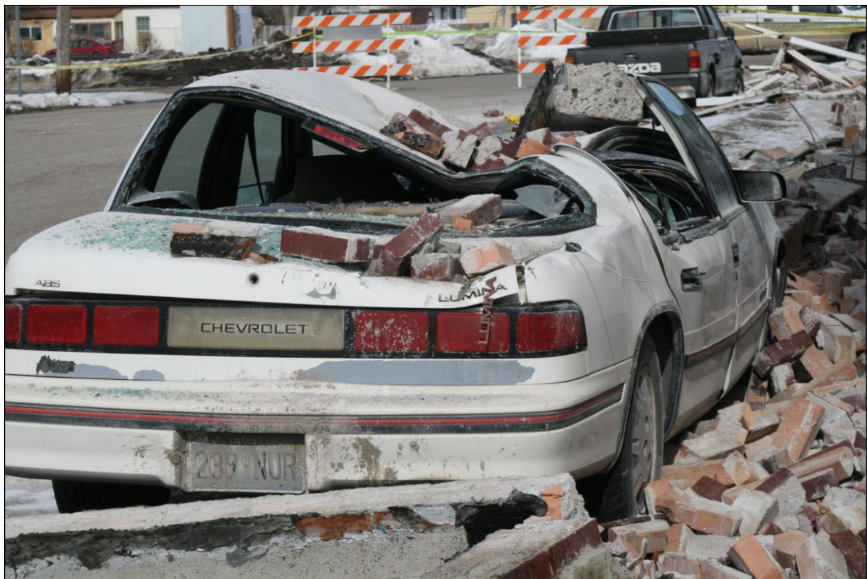
Figure 5. Car hit by the falling bond beam and bricks. The divot in the roof shows where the impact was.