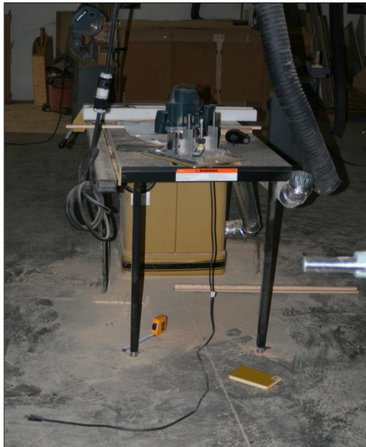
Figure 13. Router table which has slid towards the lower left side of the photograph as the ground moved in one or more pulses in the opposite direction.